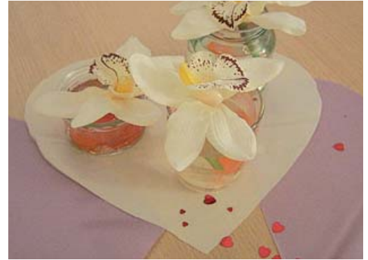
Decorations made by the students for the Valentine's Disco

Our values underpin all that we do and influence all our decisions